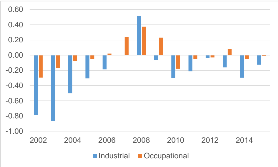
CHART 1 TOTAL JOB MIXES, ANNUAL CHANGE, UNITED STATES