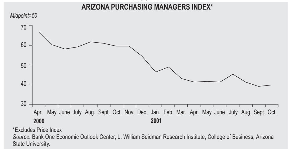
FIGURE I ARIZONA PURCHASING MANAGERS INDEX*